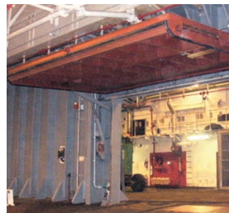
RFA ARGUS, ROYAL NAVY, UK