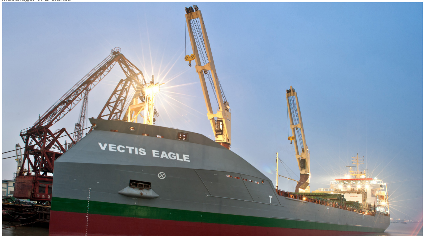
MacGregor VFD cranes