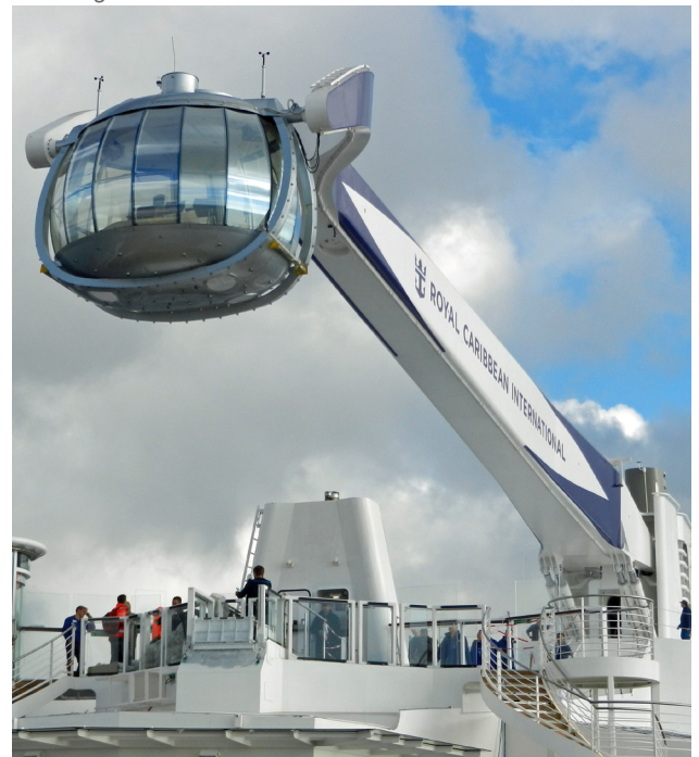
MacGregors North Star

Modern cranes complying with international standards and regulations.