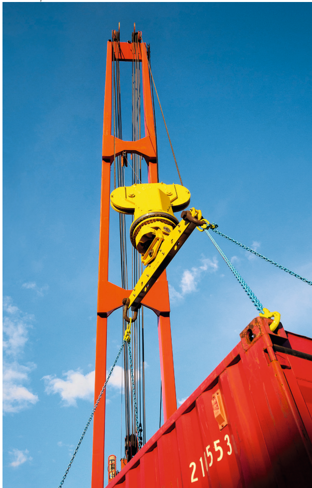
Electric power swivel with ARC