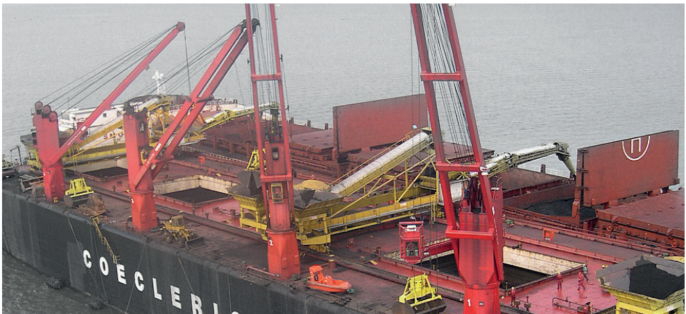
Exemplary data for type V